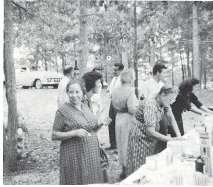
SPANISH PICNIC A HUGE SUCCESS