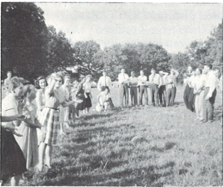
Egg Throwing — Marriable Picnic