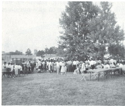
Largest Negro Picnic Yet